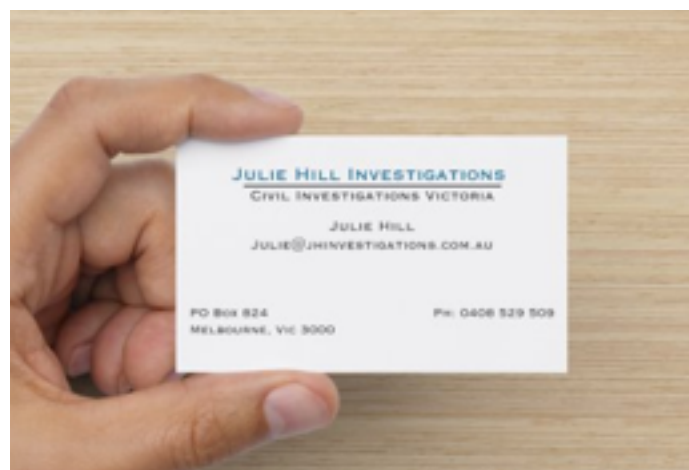
Mock up business card from Vistaprint

You can easily get 200 business cards delivered to your door for under $50. The mock up below was done on vistaprint.com.au and took five minutes to type in the information on one of their templates and the total cost for 250 business cards delivered by standard post was $27.98. Cheap as chips and well worth the investment!